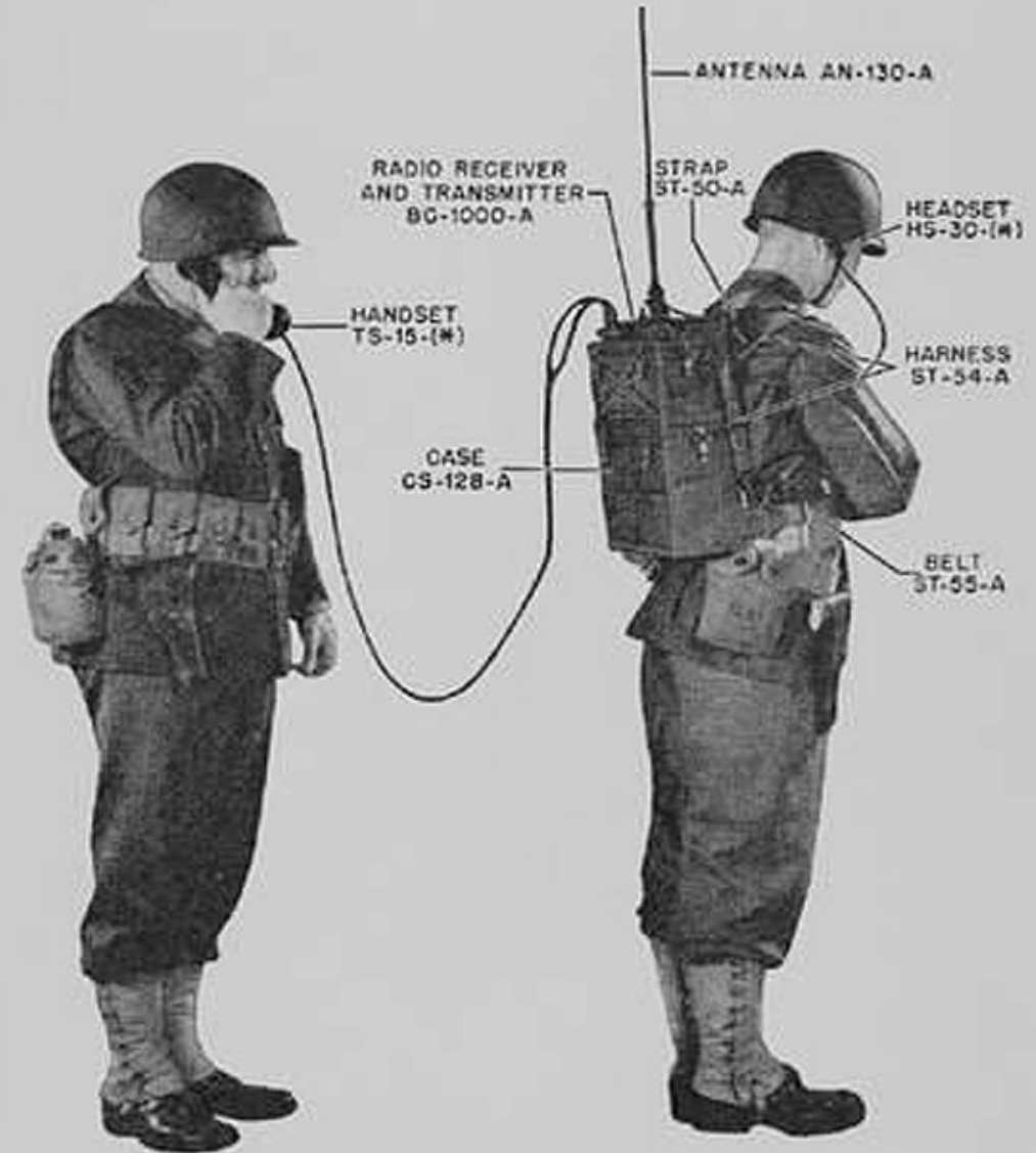
Figure 1. Radio Set SCR-300-A. In Use, Viewed From Right Side.